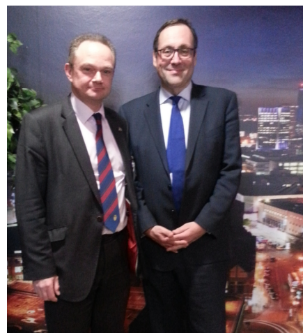
At West Midlands Strategic Migration Partnership with Richard Harrington MP – Secretary of State Responsible for Refugees

These families will have come directly from the refugee camps on the Syrian borders and have been interviewed prior to arriving in Stafford, to ensure that we can provide all of the specialist support – whether it be healthcare, education or housing – to meet their needs.