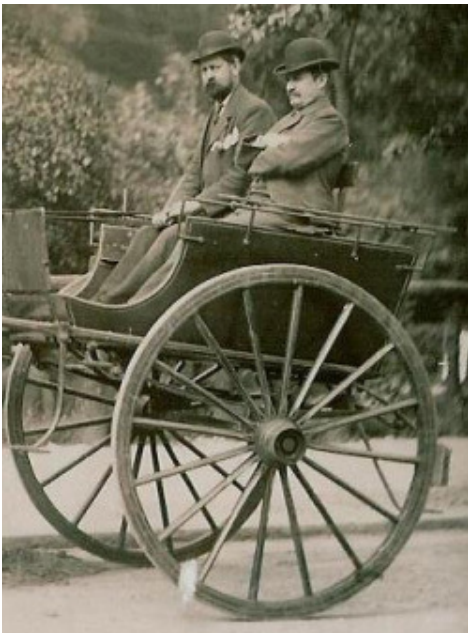
An example of the traditional trades being remembered in local street naming

Instead, following liaison between both the developers of the site and the Borough Council, sense has prevailed and instead Eccleshall Parish Council, in consultation with members of the Historical Society and community, has been able to put forward their ideas for suitable road names.