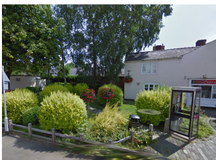
Eccleshall Toilet Area in Spring

The Eccleshall Toilet area has long been a dark and dank place in the centre of the town.