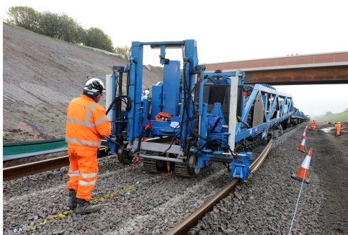
Specialist track laying equipment at Norton Bridge – as part of the laying of 10Km of new track

In addition a small number of ancient bottles have been retained in Stafford and it is hoped that these will be put on display at The Ancient High House so that these important finds can remain and be seen in the local area that they were unearthed in.