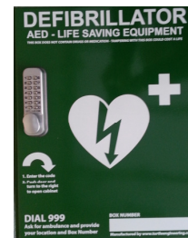
Croxton Service Station is the latest location to get a defibrillator as part of the network of units locally – all designed to save lives

This has been supported through the coming together of joint funding agencies including Staffordshire County Council, West Midlands Ambulance Service, Eccleshall’s First Responders as well as the local Broughton and Croxton Jubilee Fund.