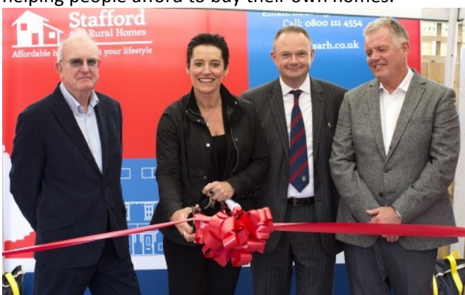
Opening of affordable homes in Hixon, during Rural Housing Week

With the need to build more homes for people to live in, or maybe get their first steps on to the housing ladder, I have visited more housing developments across Stafford Borough than I can remember ever doing before in a twelve month period. That’s houses of all types of tenure – for home ownership, social housing as well as private rented – across all areas of the Borough. Over the next three years more than 300 new homes will be built by Stafford and Rural Homes, with a number of new innovative schemes targeted at helping people afford to buy their own homes.