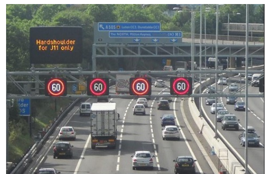
SMART Motorways in action in Birmingham

This will be by creating ‘all lane running’ through using the hard shoulder as a permanent traffic lane. Regular vehicle refuges will be created for vehicles that breakdown and significant lane signage will also help stranded motorists.