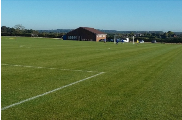
Eagles Park – with some of the best pitches in Staffordshire

In September, Eccleshall Eagles finally after many years of hard work and development, moved into Eagles Park – their new facility along the Swynnerton Road with a range of junior pitches, Club House and changing rooms.