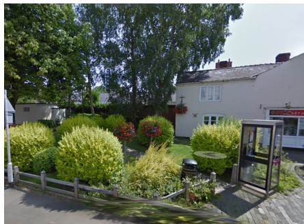
The old Eccleshall Toilet Area in Spring

A desire to improve the area, whilst also reduce some of the cost of maintenance, led to a site visit in October last year, which revealed much to everyone's disappointment that the poplar trees on site had tree canker and need to come down before they fell down.