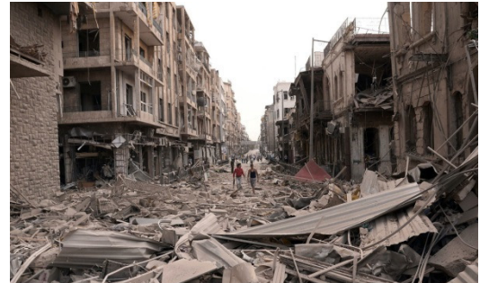
War-torn Aleppo, Syria

Stafford committed back in September 2015 to offer shelter and support to five Syrian Refugee families, as part of a commitment to welcome fifty Syrians into the County and 10,000 into the UK.