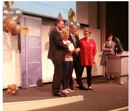
Stafford Borough Council’s Housing and Homeless Prevention team pick up their award at the National Homelessness Practitioners Annual Conference, in Warwick

The work back in July was recognised at the National Homelessness Practitioner Conference as part of their Gold Standard Award presentation.