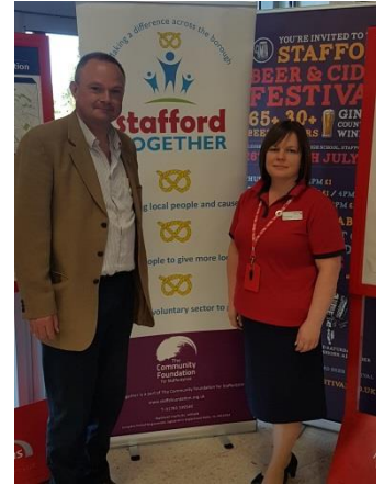
Crowds being entertained at Stafford Together's stand at the County Show and Virgin Trains, Stafford getting involved with Stafford Together

For further details of how to get involved please go to Stafford Together's Facebook Page or the Community Foundation for Staffordshire's website – Stafford Together .