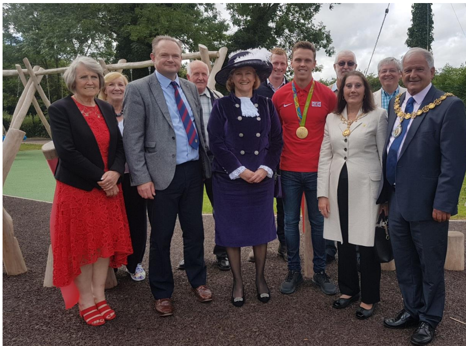
At the Community Opening of Norton Bridge Recreation Area

The project led by Chebsey Parish Council and Friends of Norton Bridge, on what was once a Stafford Borough Council play area, raised in excess of £50,000 in a little over two years, proving what can be achieved when a community comes together with a common objective.