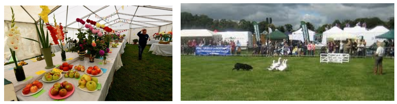
Vision – for Eccleshall to be a place to live, work and thrive in the twenty first century