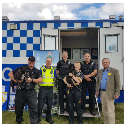
Staffordshire's Rural Crimes team, including trainee Police Dogs at this year's Eccleshall Show

The analysis of the responses will no doubt continue for a while to come, but it is clear that most people are concerned about car parking in town, significant numbers