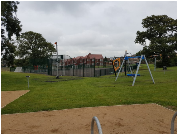
The Bovis Play Area on the new Sancerre Grange housing estate in Eccleshall, where it has taken eighteen months to get the developer to finally open the play area

Legal agreements—commonly known as Section 106s—are regularly used in the planning system to require developers to put in community facilities to meet the needs of the new estates that they build. However no one expected the play area on the Sancerre Grange estate in Eccleshall to take eighteen months of wrangling to be opened.