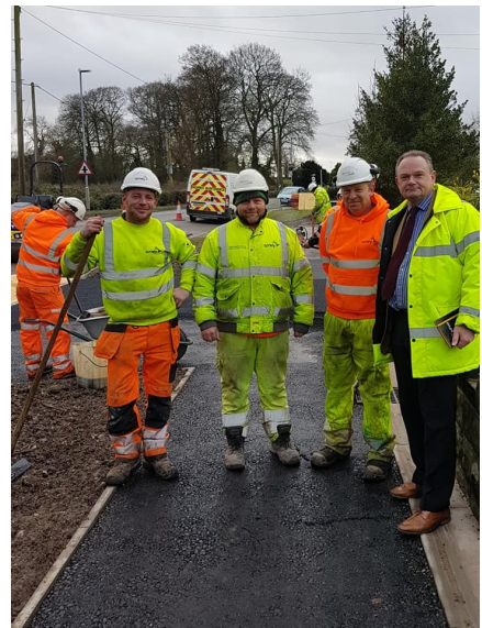
The works in Great Bridgeford will be finished by the end of January 2020 and it is hoped that these will last for at least the next thirty years

month period have cost in excess of £350,000 and involved four to seven men on site over the period.