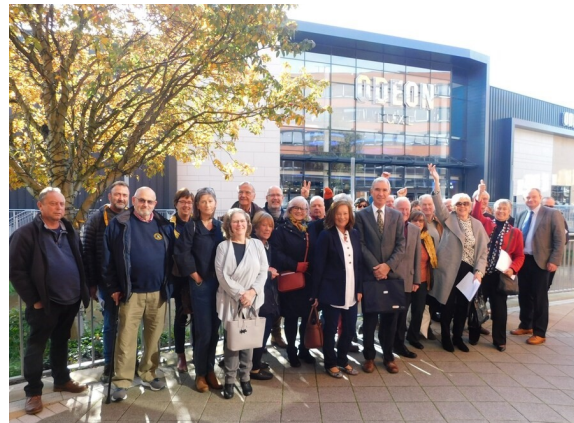
Members of the public after the Tree Preservation Order was confirmed, celebrating that the trees will remain part of the local skyline

At a time when we need to become Carbon Neutral , removing trees seems to be the wrong thing to do.