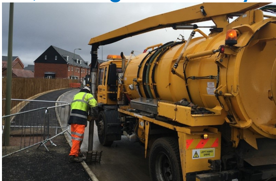
Gully emptying has been prioritised to get as many longstanding blocked gullies working

January 2019 started with an additional £20,000 coming into the local area to support additional Highways maintenance.