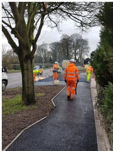
Highways teams working on the footways in Great Bridgeford

month period have cost in excess of £350,000 and involved four to seven men on site over the period.