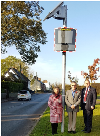
Installation of Speed Indication Devices in Eccleshall

Back in October 2019, Eccleshall Parish Council became the third Parish Council locally, following Great Bridgeford and Swynnerton to react to local residents concerns about the speed of traffic in their area, by installing mobile Speed Indication Devices (SiDs).