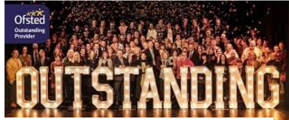
OFSTED rated the College Outstanding

But the official verdict of how the transformation has progressed was delivered in November by OFSTED when they adjudged the Colleges Group to be OUTSTANDING .