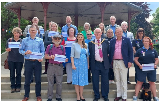
Stafford Borough Small Grant recipients at Her Majesty The Queen's Platinum Jubilee celebrations

There is another round of Small Grants open at the moment, which closes on 9th September 2022. Further details are available here