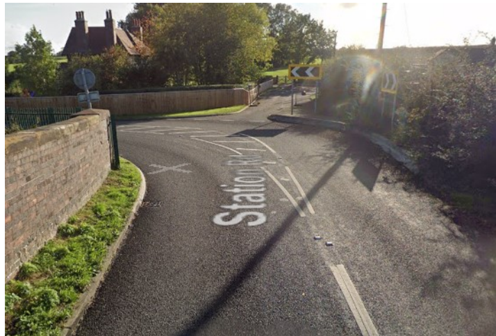
Stone Road, Norton Bridge where EE wanted to install a phone mast

Following some pre-application discussions, where objection was made to the location due to road safety concerns and the fact that it was an existing 'accident black spot', but not the principal of improving the service locally for all users, the operator instead of finding a new location choses to better protect the mast were it to be hit by an errant vehicle on the bend.