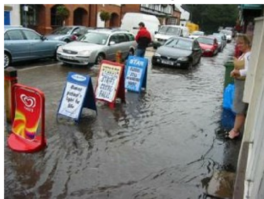
Surface water flooding, Stafford Street, Eccleshall

Back in 2014 the opportunity to increase the size of the drains along the Stone from the centre of Eccleshall to the pumping station was missed, when the Stone Road was being resurfaced.