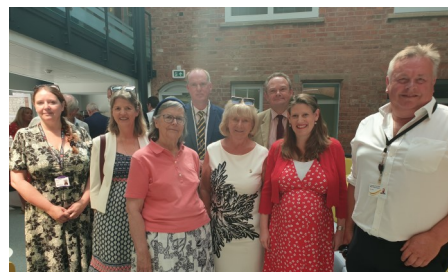
Stafford Borough and County Councillors at the re-opening of Shire Hall with MP for Stafford, Theo Clarke

Until that is a £2m investment was secured to bring the iconic building back to life as a Business Enterprise Centre, with flexible modern office space as well as contract lets. The Stafford Chamber has been one of the first to take up occupation, after it formally re-opened in the middle of July 2022.