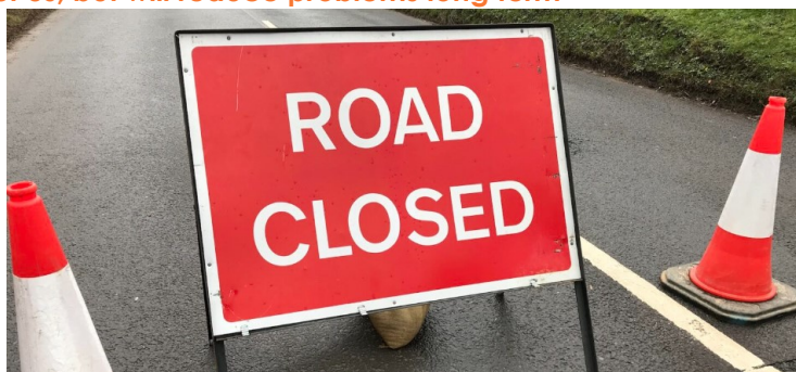
The road between Eccleshall and Stafford will be closed from Monday 12th September 2022 during the day for a week

A Highways Engineer will then be sent out to investigate the nature of the problem and assign the response to the relevant team within County Highways. Without residents reporting the concern, highways issues can go on unresolved for many years.