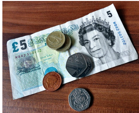
The cost of living crunch will affect many, including from new communities unused to providing this level of help and support to a growing number of individuals

PLEASE USE THE LINKS IN THE ABOVE TO FIND OUT MORE ON THE VARIOUS SCHEMES