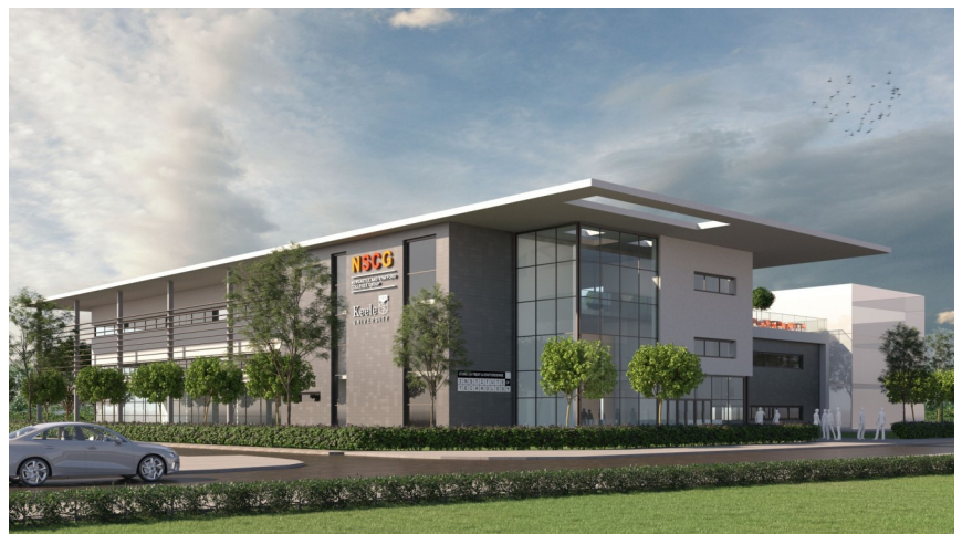
Stafford is to benefit from an Institute of Technology, which will open in Autumn 2024 and will fill the gap between FE & HE

and Stafford Colleges Group (NSCG) to secure one of the remaining IoTs is a huge opportunity for education and the County Town, and coming so