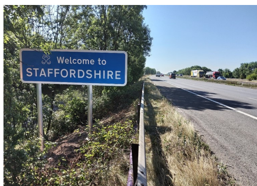
“Welcome to Staffordshire” signs that have been installed on the M6 motorway to show the County boundary at a cost of £17,000

Many Counties advertise to road users that they are entering their region and for the last four and a half years discussions have been taking place with National Highways—formerly Highways England—for Staffordshire to have the same. This also incorporates the County’s new ‘place’ logo.