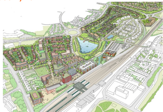
The Stafford Station Gateway—a community incorporating the latest in design and modern living, with working space onsite

All supported by high quality public realm and open spaces, including an upgraded water corridor running through the study area and a unique lakeside setting.