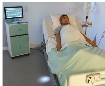
Staffordshire University have recently opened their Health Innovation Centre at a cost of £5.8m

The investment also includes simulation Wards, where patient interventions can be monitored with different responses programmed and monitored in real time.