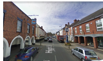
Eccleshall High Street will be surface dressed in 2023

So the completion over three successive Sundays in November and December of preparative works for the High Street in Eccleshall to be surface dressed during 2023, was welcome news and a welcome sight as this should keep the High Street looking its best and not needing more significant works for many years to come.