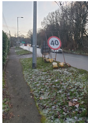
New 40mph Speed Limit at Newcastle Road, Hanchurch