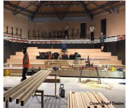
Stone's Crown Wharf Theatre—one of a dozen projects to receive funding from the Borough Council to support their ambitious plans for a new community space for over 200 people, which will open in 2023

Additional moneys have been set aside to support and boost the rural economy, given that so much of the Borough is