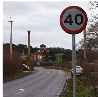
New 40mph Speed Limit at Hatton round the waterworks and cottages