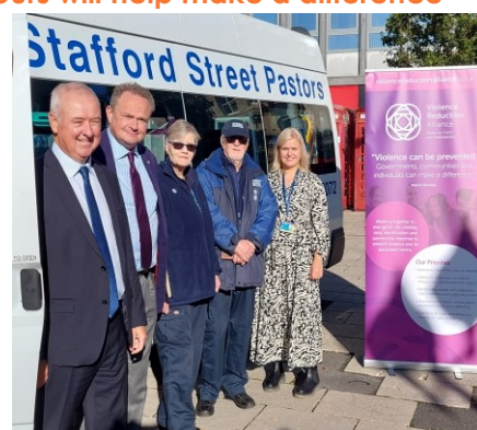
Funding and partnership working with Stafford Street Pastors to offer a 'safe space'

This initiative is part of a successful funding bid from the government's Safety of Women at Night Fund (SWaNF), including creating safe