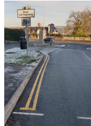
No parking round the junction and Tittensor War Memorial on Winghouse Lane