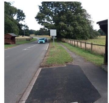
Access improvements for bus users in Swynnerton

Many of these schemes can cost between £4.5—£7.5k to deliver with multiple rounds of consultation and the need to get the process properly executed so that the restrictions are legally enforceable. Hence the sheer volume of time that they take to deliver.