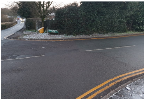
No parking—Double Yellow Lines at Ferdown Drive South