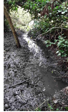
'Before' and 'After' Photos from some ditch clearance works to reduce the risk of flooding

remedial measures to go alongside the work that they have already done to remove roof water from the foul water drainage system.