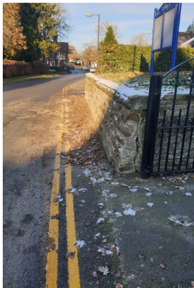
No parking—Double Yellow Lines round bends in Swynnerton

Therefore it is pleasing to see the delivery of a large number of schemes that have been championed by local communities this quarter, including :-