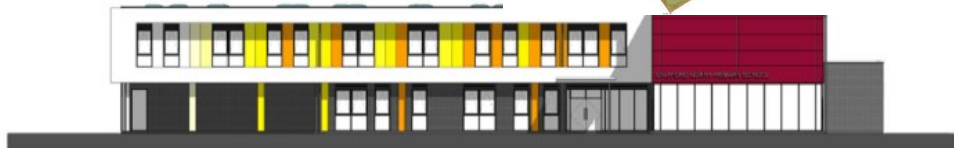
Plans have been submitted to Staffordshire County Council to build a new Primary School on Marston Grange, north of Stafford

The school is designed to Department for Education standards and the building will be very thermally efficient, for example the orientation of the buildings was selected based on maximising solar gain and it will obviously allow a 'walk or cycle to school' option for many of the residents on the Marston Grange estate. The school is anticipated to be in use for the educational year starting in September 2024.